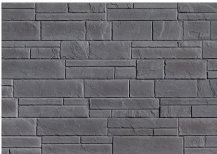
HORIZON - BASALTO

The Horizon collection creates a statement on its own in a fluid stone system to fit today's design trends. It offers elegance to any contemporary designed home and is easy to match with other siding.