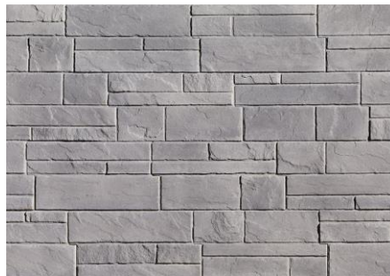
HORIZON - GRIJO