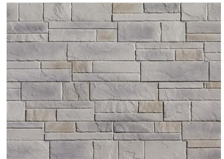
HORIZON - CARBO